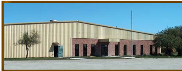
Precision Pulley & Idler located at the Blue Grass Industrial Park • Corning, Iowa