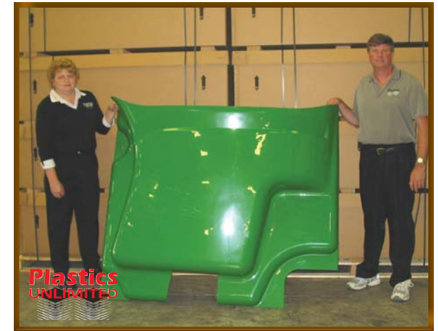
Plastics Unlimited • Preston, Iowa

The RLF requires adequate collateral for the loan request. Preferred security is an irrevocable letter of credit or a first lien on real estate and/or machinery & equipment.